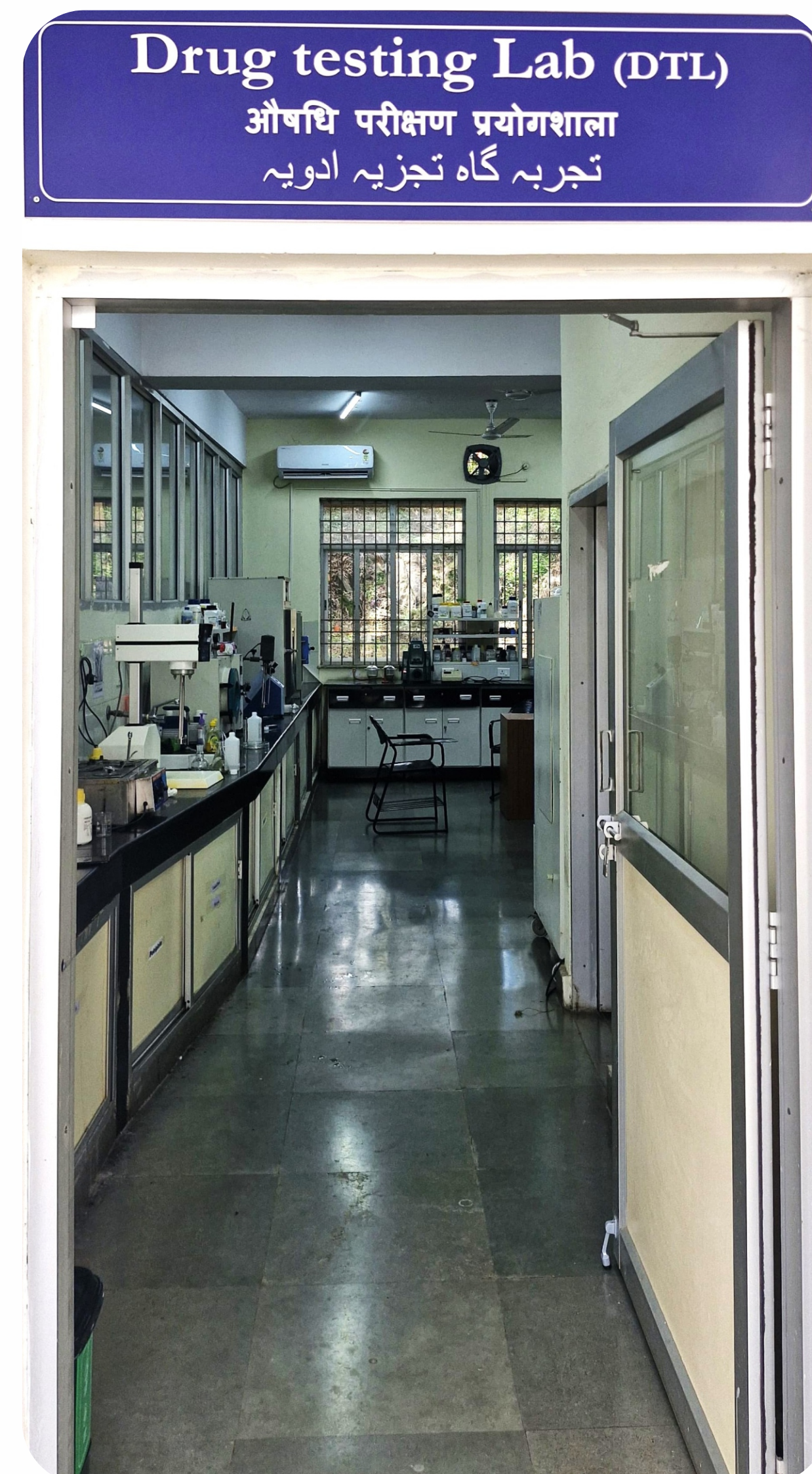
Drug testing Lab (DTL) औषधि परीक्षण प्रयोगशाला تجربہ گاہ تجزیہ ادویہ